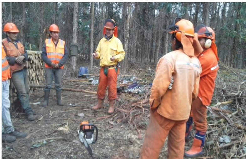
Figure 5. Training on security and risk prevention when using logging machinery (conducted on 10 August 2015)