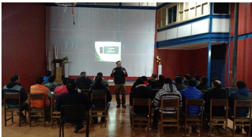
Figure 7. Labour risk prevention and worker safety training for workers in management positions (conducted on 23 July 2015)