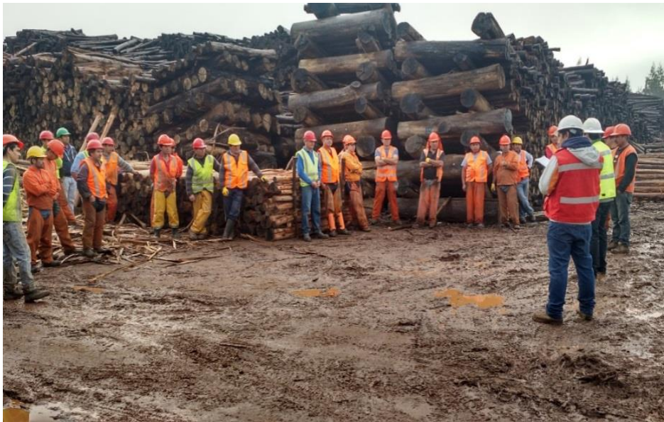
Figure 4. Training on safe working practices, safety regulations, FSC requirements, and personal safety (conducted on 19 June 2015) – 25 workers from the subcontractor Emsefor Fabián Ancamilla attended

Bosques Cautin has also implemented a Programme for the Support for Contractors of Mapuche Origin to Improve their Access to Technologies. This support has been provided through the technical services of an assessor. Bosques Cautin currently has seven stable subcontractors, of which four are of Mapuche origin. Since May 2015, the subcontractors have had access to the support programme through which they are receiving training and acquiring new skills on different topics such as safety and environmental issues. One of the subcontractors (Rama Verde) is also receiving specific support from the assessor to acquire specific professional skills in the use of technically advanced machinery for timber harvesting (skidder). Bosques Cautin's aim is to provide the services of this assessor to all other company's subcontractors in the future, in order to increase the technical skills and capacity of its subcontractors.