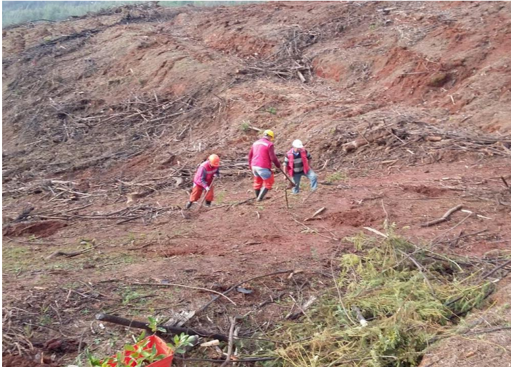
Figure 1. Day 2 of the river basin restoration by Bosques Cautin