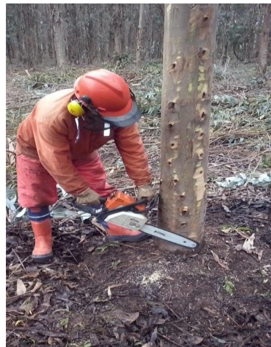
Figure 6. Training on security and risk prevention when using logging machinery (conducted on 10 August 2015)